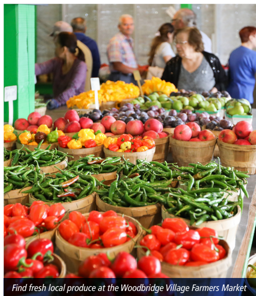
Find fresh local produce at the Woodbridge Village Farmers Market