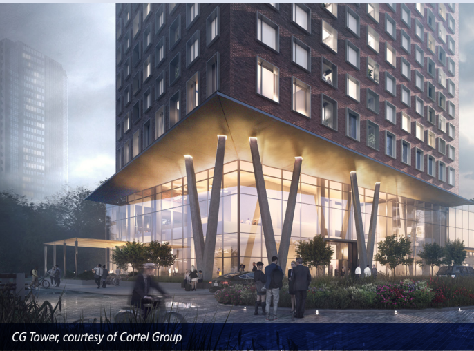
CG Tower

Source: Toronto Real Estate Board, Rental Market Report Q2 2019 (rent), Market Watch, August 2019 (sales prices)