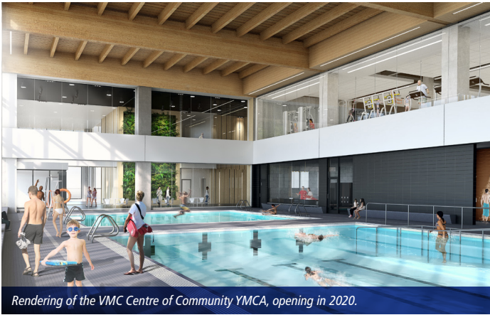
Rendering of the VMC Centre of Community YMCA, opening in 2020.