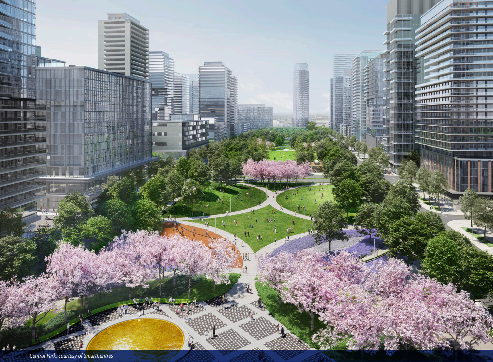
Central Park