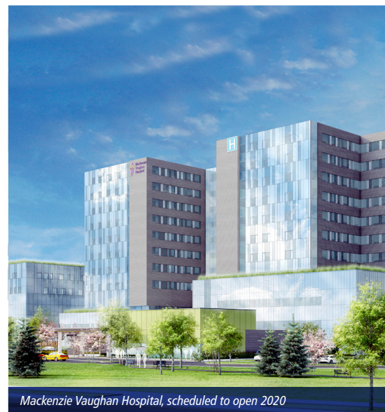
Mackenzie Vaughan Hospital, scheduled to open 2020