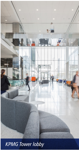
KPMG Tower lobby

91% of businesses are satisfied with the delivery of services provided by the City of Vaughan.