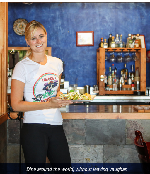
Dine around the world, without leaving Vaughan