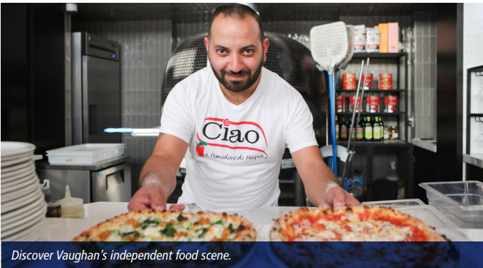
Discover Vaughan's independent food scene.

Vaughan is known for Canada’s Wonderland and Vaughan Mills, but also has cultural and natural gems like the McMichael Canadian Art Collection, charming Kleinburg Village and the Kortright Centre for Conservation. When the sun goes down, satisfy Italian food cravings in Woodbridge or dress to impress at a nightclub in Revel Park.