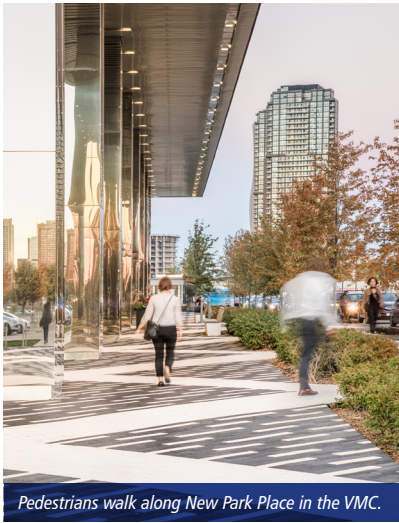
Pedestrians walk along New Park Place in the VMC.

97% of citizens reported Vaughan’s quality of life as being good or very good.