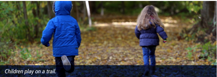
Children play on a trail.

Exciting restaurants like Buca and Bar Buca will be social hot spots in the VMC. The VMC Centre of Community, opening in 2020, will have a full-scale YMCA, public library and City-owned creative expression and learning hub. Outside, there will be places to recharge like the lush Edgeley Pond and Park and urban Central Park. Both are scheduled to be under construction within the next two years.